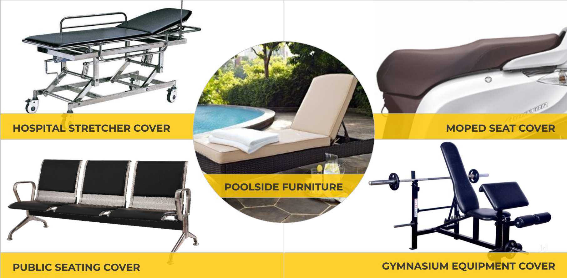
HOSPITAL STRETCHER COVER

The product - Artificial or Synthetic Leather or Vinyl Coated Fabric - is fast replacing natural leather for multiple products all over the world because of its durability, excellent resistance to degradation, ease of maintenance and cost effectiveness.